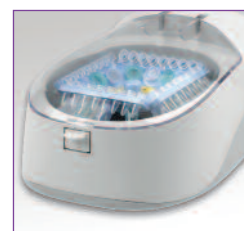
Compact, low profile design